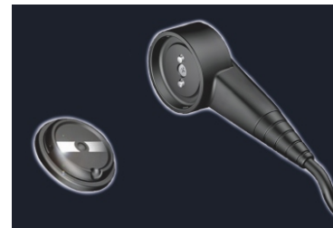
... MagCode PowerSystemPro (Max. current load up to 25A, with mechanical bayonet lock)