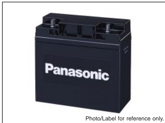
(a) The photo and dimensions represent LC-X1220P.